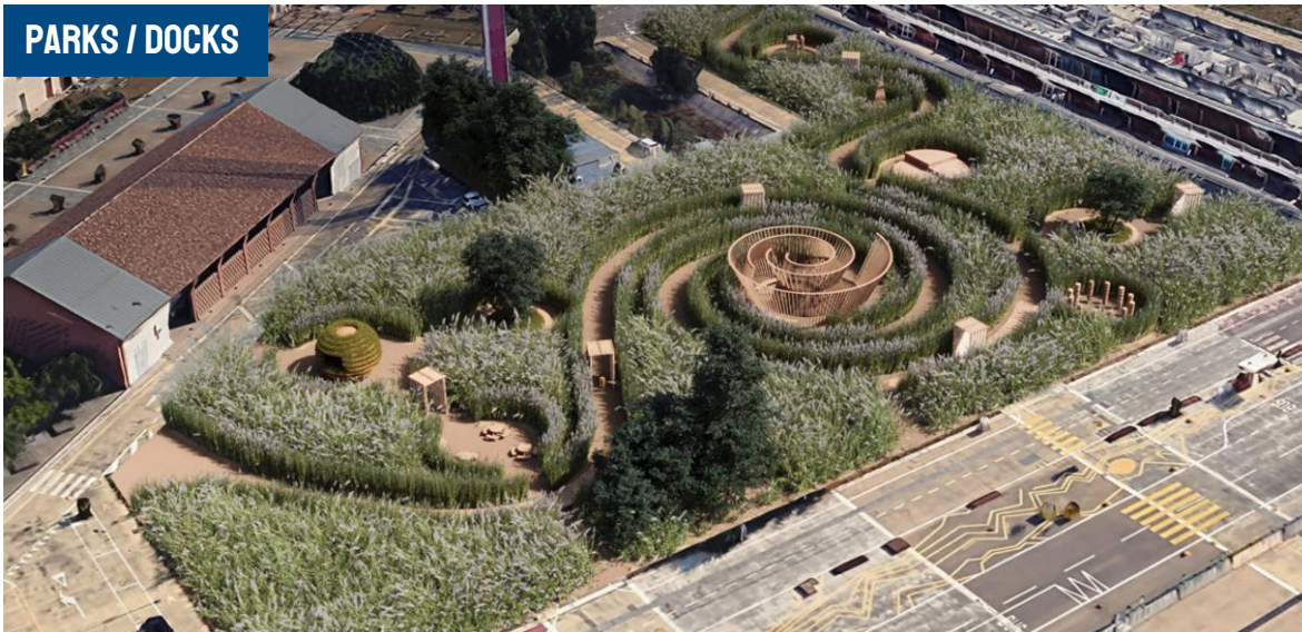
PARKS / DOCKS