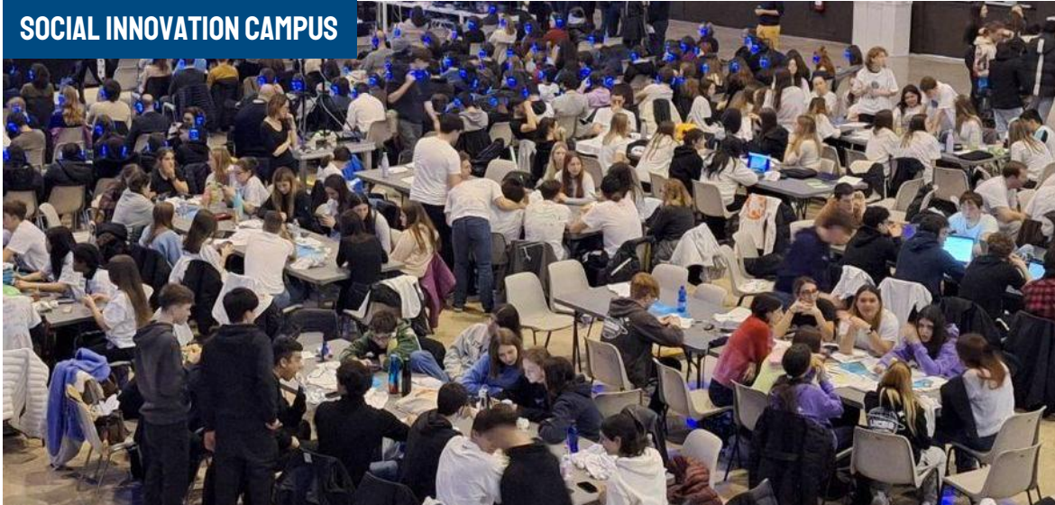
SOCIAL INNOVATION CAMPUS