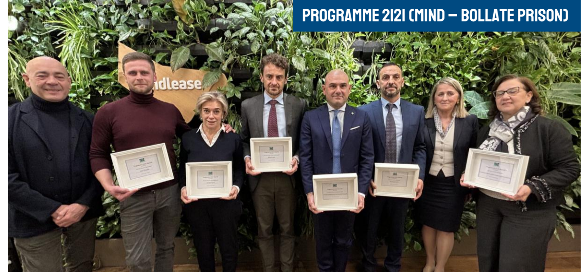
PROGRAMME 2I2I (MIND – BOLLATE PRISON)